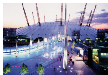
Peninsula Square, London