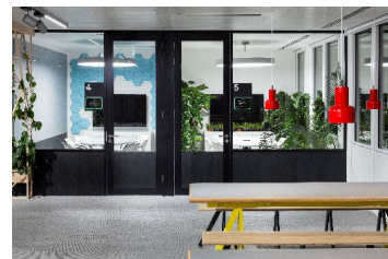
Cundall London, One Carter Lane

For further information or to apply please visit www.cundall.com/careers